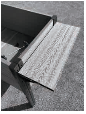
cover corner posts with end caps.