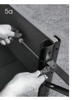
Use a 5mm hex wrench to hold the bolt and a 13mm wrench to tighten the nylon lock nut.

Distributed by: Dynaforge Trading LLC St. Paul, MN55101 Email: sales@everbloom-garden.com