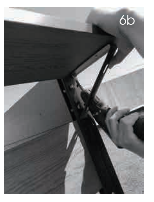
7. Install side board and