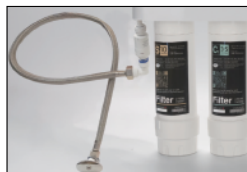
Connect the inlet hose to angle stop valve