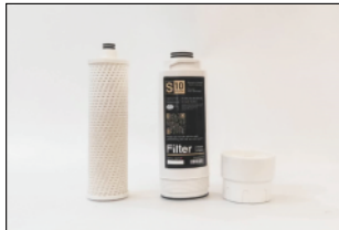
Replace with a new filter cartridge and screw back in