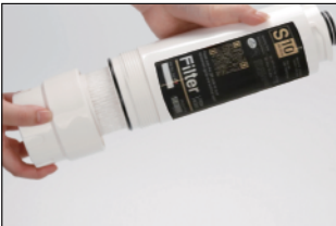
Take out the inside filter cartridge