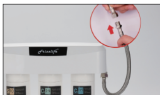
Connect the outlet hose to the faucet hose