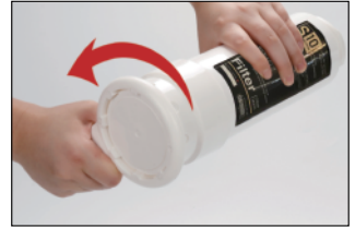
Use the wrench to screw off the bottom cap