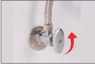
Shut off the water supply