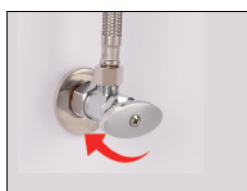
Turn on the water supply