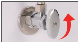
Shut off the water supply