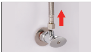
Remove the existing water hose