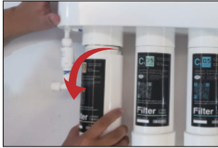
Turn the housing counter clockwise, remove the housing