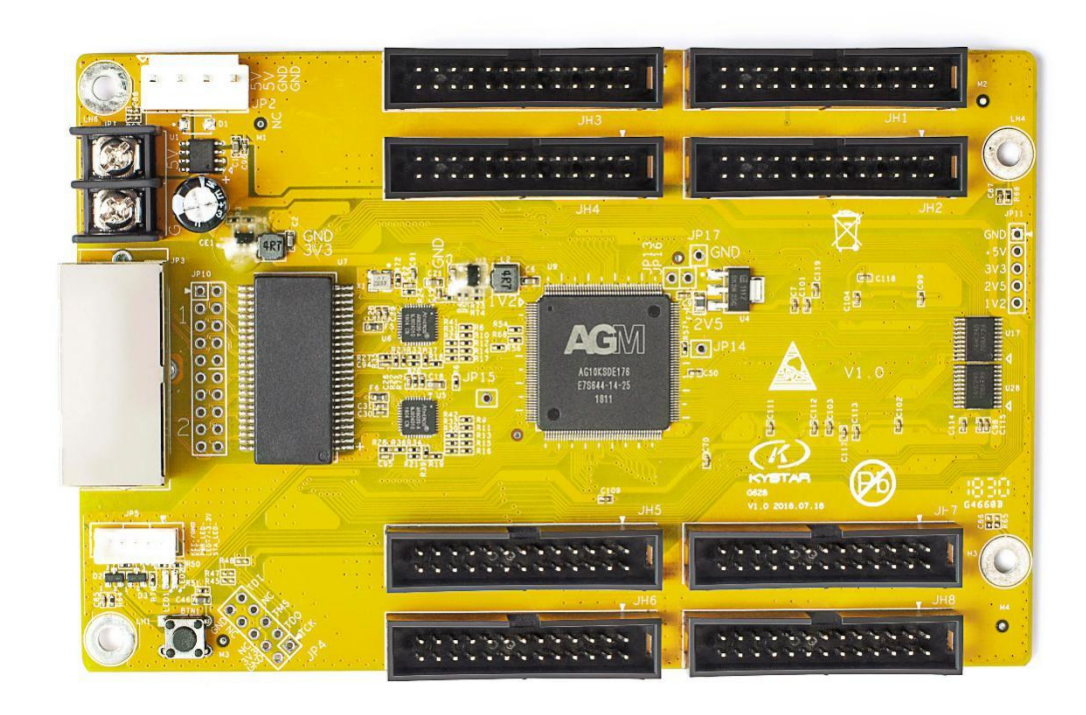
Figure 1 G628 Receiving card