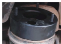
The installation picture for reference

Re-torque all lug nuts on the spacer after 100-200 miles of driving.