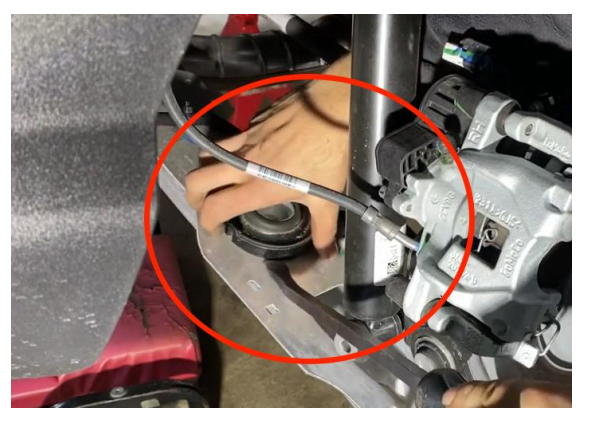
7.Remove the trailing arm bolts on the frame.