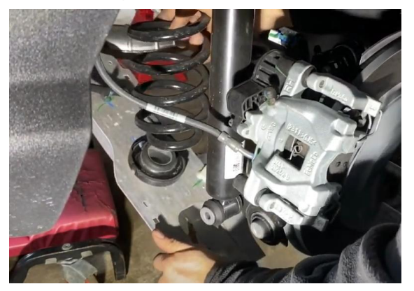
6.Remove the rubber spring seat with a flathead screwdriver.

5.Push down on the control arm to free the spring from the control arm, a flathead screwdriver may be needed to remove the lower spring pad from its location.