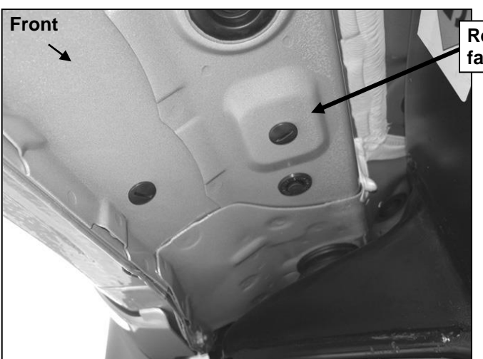
(Fig 1) Driver side front mounting location pictured

Remove plastic plugs or factory hex bolts (if equipped)