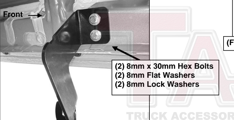
(Fig 3) Driver side center mounting location pictured