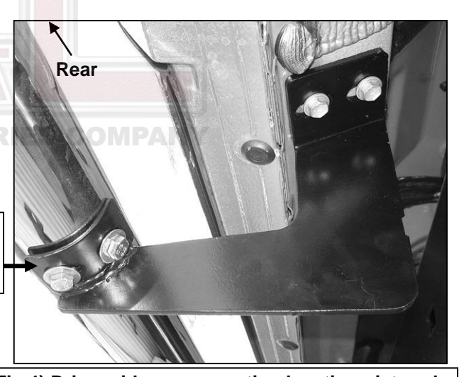
(Fig 4) Driver side rear mounting location pictured