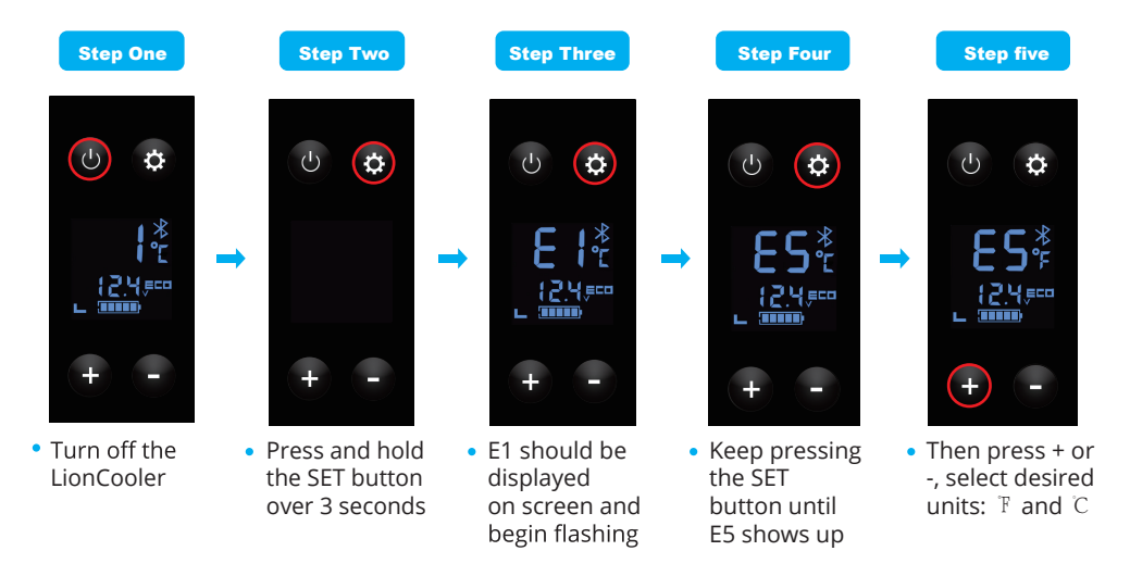
STEP 4 . Using LiONCooler in a Vehicle - protect your vehicle battery:

With the AC power cord connected to a wall outlet, use the power button and turn the cooler OFF. Also turn the battery power button OFF. (See step1). The LED display will be blank BUT you can operate the SETTINGS in this mode. Press and hold the SETTINGS button (gear wheel) for about 3 seconds. Release the button when you see a flashing E1 displayed on screen; briefly press once and release the SETTINGS button again until E5 is displayed. Next press + or - to toggle between your desired temperature display units: \mathbb{F} and \mathbb{C} .