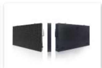
4ft x 2ft