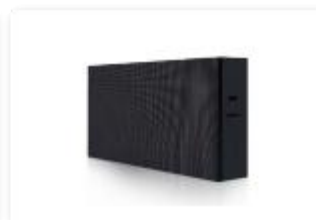
6ft x 3ft