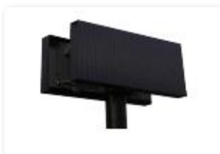
8ft x 4ft Back to back