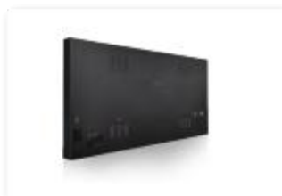
7ft x 4ft