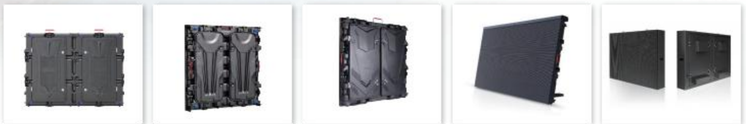
4.2' x 3.15' (1280mm x 960mm)

Dual Service /High Brightness 5500nit~10000nit/ High Contrast Ratio/ More Pixels Available