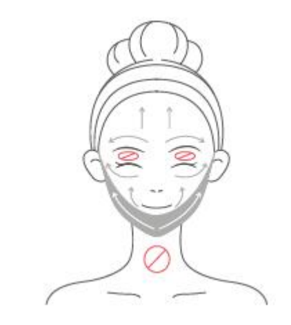
• [Eye care mode]: 4 minutes, 2-3 times per week