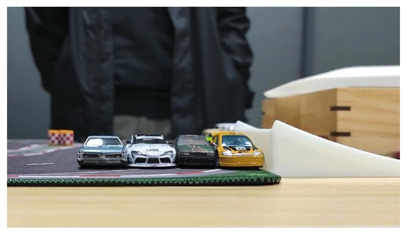
Switch to Brust Mode for more speed and higher power in car racing