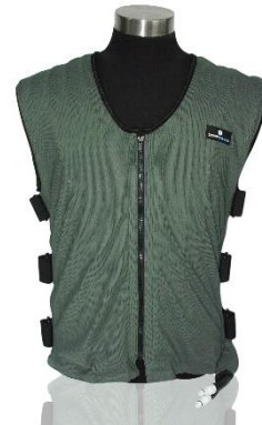
Liquid Cooling Vest