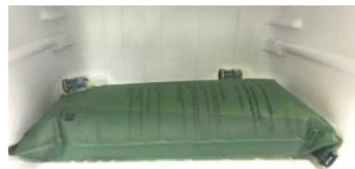
Lay Flat Freeze

Step IV-Start circulation with ON/OFF switch or Temp controller.